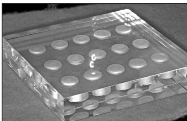
Fig. 1: Test specimen matrix for obtaining the 15 specimens.