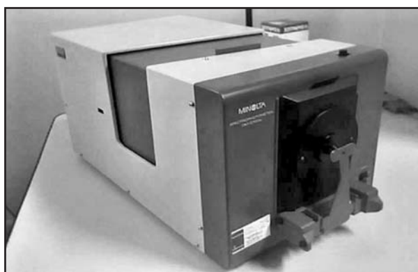
Fig. 2: Measurements being taken with the roughness meter.