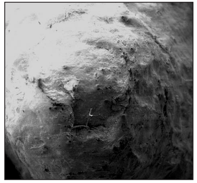
Fig. 3: SEM micrograph representative of Type III root apex (original magnification X50).

Although SEM provides a more accurate examination of the root apex anatomy, its use for assessment of the apical openings is still scarce. Morfis et al.<sup>12</sup> analyzed the apices of human permanent teeth under