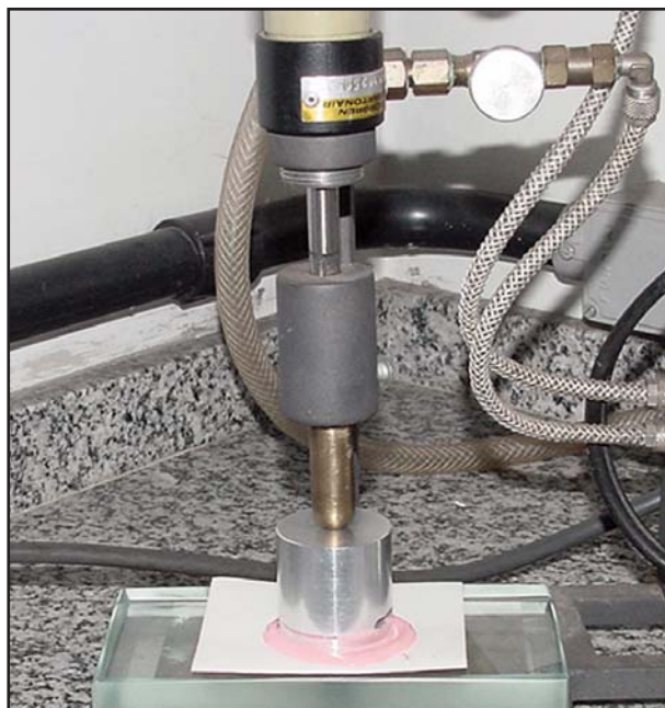
Fig. 2: Method of positioning of the tray and matrix with a pressure of 2 kgf using a pneumatic press.

Thus, the samples were divided into 12 groups ( n = 5 ) according to storage time and alginate impression material: Group 1: no storage time (control group) + Jeltrate Plus; Group 2: no storage time (control group) + Cavex ColorChange; Group 3: no storage time (control group) + Hydrogum 5; Group 4: stored for 1 day + Jeltrate Plus; Group 5: stored for 1 day + Cavex ColorChange; Group 6: stored for 1 day + Hydrogum 5; Group 7: stored for 3 days + Jeltrate Plus; Group 8: stored for 3 days + Cavex ColorChange; Group 9: stored for 3 days + Hydrogum 5; Group 10: stored for 5 days + Jeltrate Plus; Group 11: stored for 5 days + Cavex ColorChange; and Group 12: stored for 5 days + Hydrogum 5. The stone models were separated from the tray containing the alginate 1 h after the start of stone mixing.