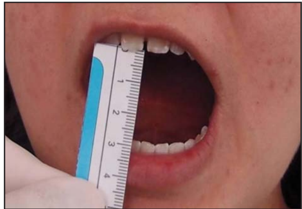
Fig. 1: Recording Maximal Opening.

Values in mm were: maximal unassisted opening 48.28 \pm 6.14 (CI 47.1-49.46), right lateral movement