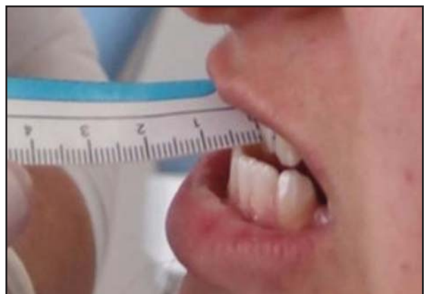
Fig. 3: Recording Protrusion.

8.78 \pm 2.50 (8.30-9.26), left lateral movement 9.60 \pm 2.64 (9.09-10.11), protrusion 4.94 \pm 2.58 (4.44-5.44) and overbite 2.98 \pm 2.5 (1.61-2.38). Values in mm found previously in mixed dentition in a group of 107 children, mean age 6.9 \pm 1.65 were: