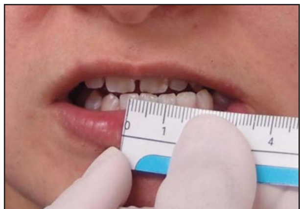
Fig. 2: Recording Lateral Excursion.