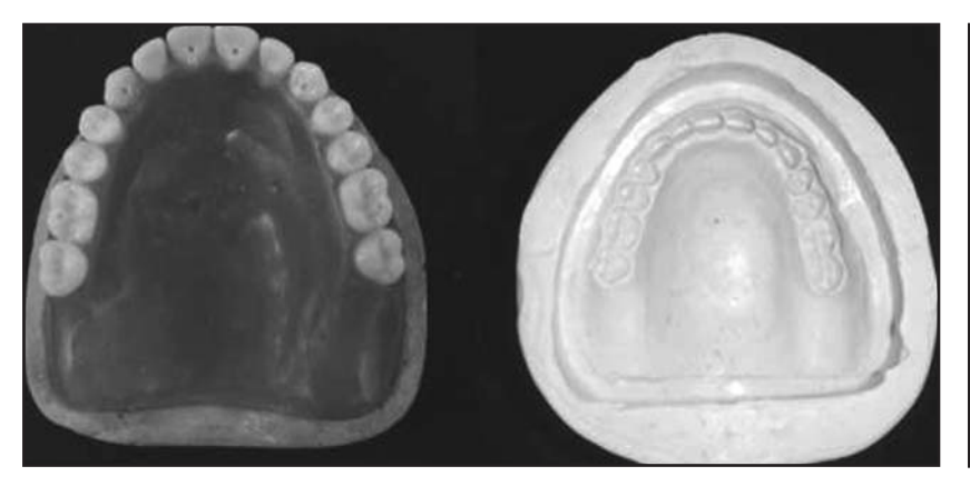
Fig. 1: Waxed superior denture and silicone mold.

After obtaining the waxed maxillary dentures, drills were made with a 701 drill (JET Carbide Burs Ltd., Brazil), in low rotation, in specific points for six follow-ups: A (distance between the mesial surface of the disto-vestibular cuspid of the 1°. right molar and the right canine cingulum), B (distance between the right canine cingulum and the left canine cingulum), C (distance between the left canine cingulum and the mesial surface of the disto-vestibular cuspid of the 1°. left molar), D (distance between the mesial surface of the disto-vestibular cuspid of the 1°. right molar and the mesial surface of the disto-vestibular cuspid of the 1°. left molar), E (distance between the mesial surface of the disto-vestibular cuspid of the 1°. right molar and the cingulum of the right central incisor), and F (distance between the mesial surface