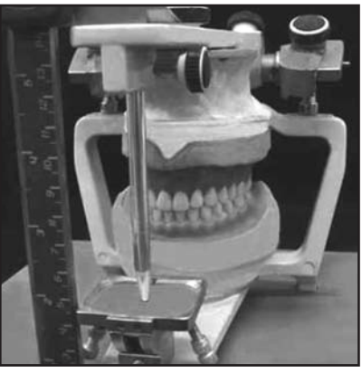
Fig. 2: Maxillary and mandibular den ture assembled as per ASA