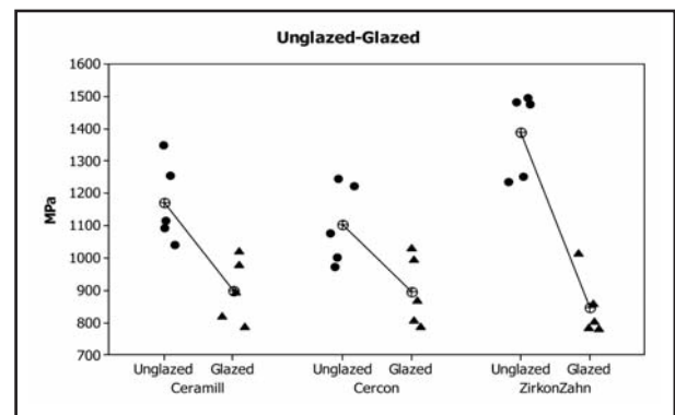
Fig. 2: Dot plot figure demonstrating the distribution of unglazed and glazed values around the mean value.