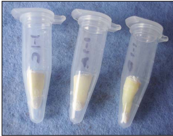
Fig. 1: Experimental groups were stored in individual plastic tubes (Eppendorf).