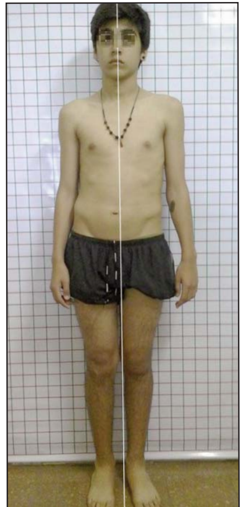
Fig. 3: Left knee tilted toward the midline (Genu Valgum).