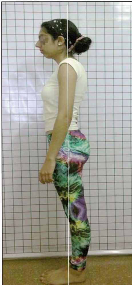
Fig. 1: Frequency of postural alterations in all groups. A: without TMD, B: with muscle disorders and C: with disk displacement.