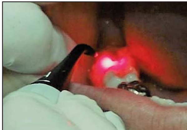
Fig. 2: Mineral Density determinations using laser induced fluorescence.