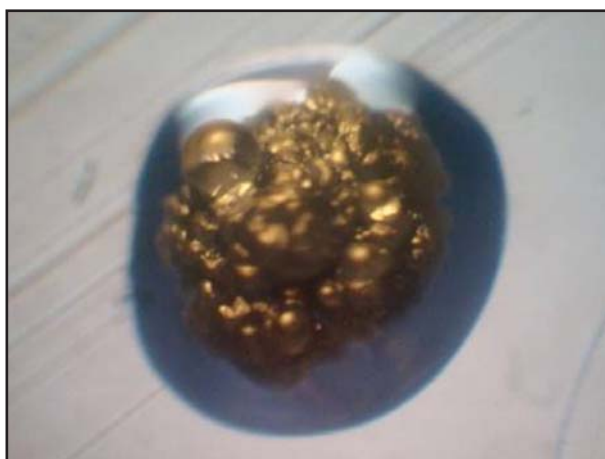
Fig. 3: Mutans group streptococci colony with insoluble extracellular polysaccharide.

value (PPV), 31.71% negative predictive value (NPV) (Table 1), 1.68 \times 10^5 UFC/ml cut off point (Table 3), 0.722 areas below the curve (Fig 4), and 4.782 risk to develop caries (Table 2). This method used in a population of 154 people showed that levels of MGS counts higher than the cut-off point ( 1.68 \times 10^5 CFU/ml), increase the microbiological risk of developing caries up to 5 times.