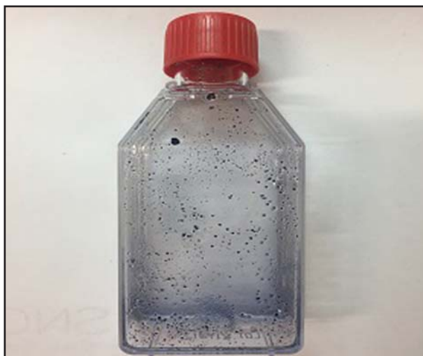
Fig. 1: Polystyrene flask with mutans streptococci adhered colonies.