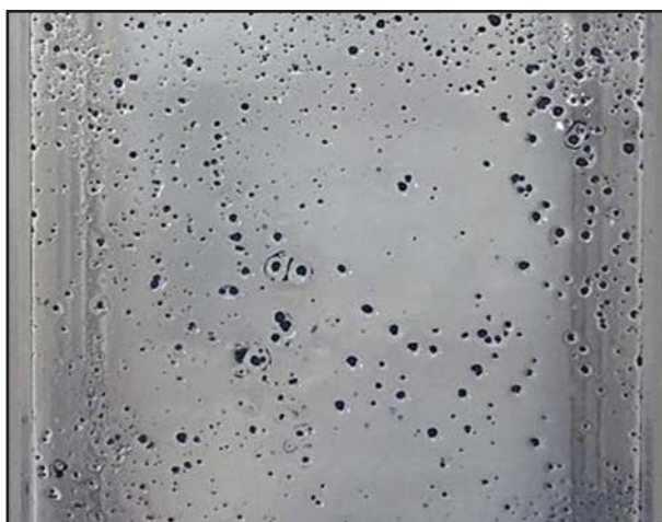
Fig. 2: Colonies adhered with insoluble extracellular polysaccharide.