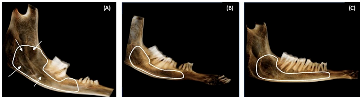
Fig. 3: Panoramic tomography of the lower left jaw of SHAM (A), OVX (B) and ZOL (C) groups. The zone delimited in white corresponds to the area of analysis by the CBCT technique. Arrows show the reduced radiodensity area in the OVX group as compared to SHAM and ZOL groups. The latter two show similar levels of radiopacity.

bone loss over time 28 . The animal model of estrogen withdrawal is ovariectomy. In the present report, as expected, bone mass and density had decreased by 30% at T=28. In addition to bone mass, the composition and microstructure arrangement of the basic components of bone play a critical role in the ability of the jawbone to support mastication. Indeed, the load required for bone deformation is